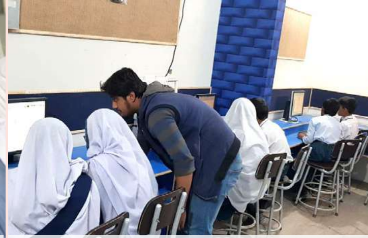
Foundation (SEF) Assisted Schools: SMHS/0110

Owing to the needs of the modern era, in order to strengthen the quality of the teaching and learning process, the Foundation provides matching/tied grants and technical assistance to the Elementary/ Secondary Schools of SEF for setting up Science & Computer Labs, provided these fit in the basic parameters of the selection for the same. By now 75 Science Labs and 211 Computer Labs have been set up in Foundation (SEF) Assisted Schools.