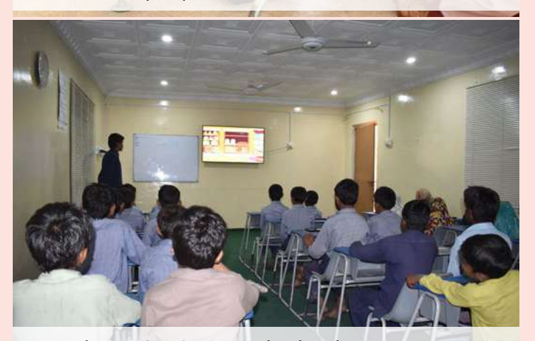
Foundation (SEF) Assisted Schools: SAS/75625