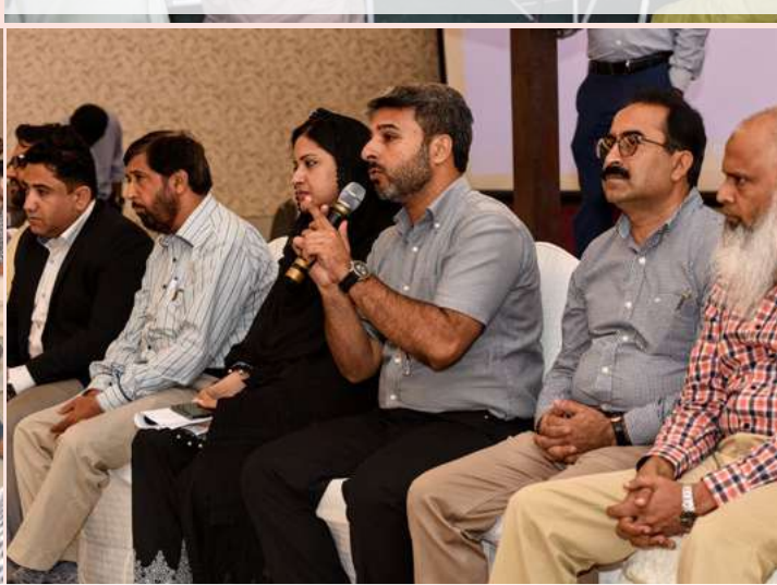
Orientation Session "Setting up of Computer Lab in SEF Assisted Schools" in Karachi